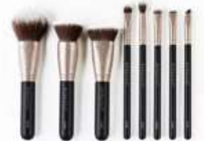
StylPro 8 Piece Glitter Brush Set ★★★★★ (23)