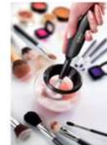
StylPro Make-up Brush Cleaner Set ★★★★★ (72)