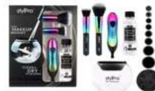
StylPro Iridescent Rainbow Make-up Brush Cleaner ★★★★★ (56)