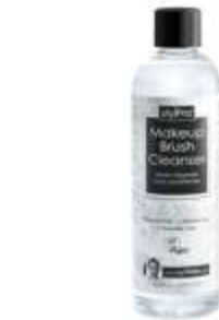
StylPro Make-up Brush Cleanser Solution - 500ml ★★★★★ (53)

REVIEWS: 5 Star Reviews as standard ★★★★★